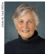
Diane Ravitch Research Professor of Education, New York University, and author of The Death and Life of the Great American School System