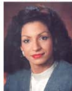
Teta V. Banks Former Consul General, Republic of Liberia